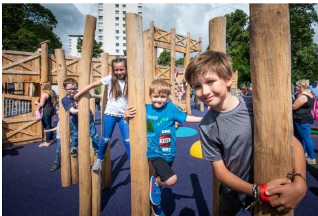
Playpark at Callendar Park